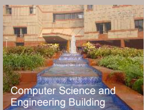
Computer Science and Engineering Building