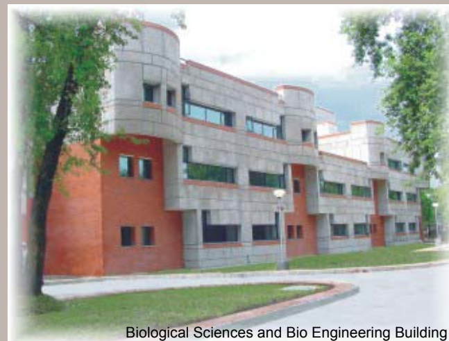
Biological Sciences and Bio Engineering Building