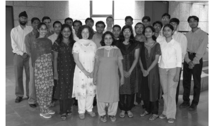
The SURGE undergraduate researchers

Undergraduate research is a pedagogical tool that helps channelise the energy and enthusiasm of students into conceptual-based education, thereby igniting their minds to explore with curiosity the world around them. It can help students (a) bridge the gap between class-room education and real world challenges, and learning the relevance of the curriculum that they undergo at the Institute, and (b) internalize and take ownership of the process of learning and education.