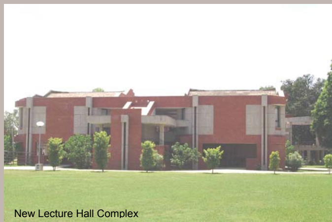
New Lecture Hall Complex