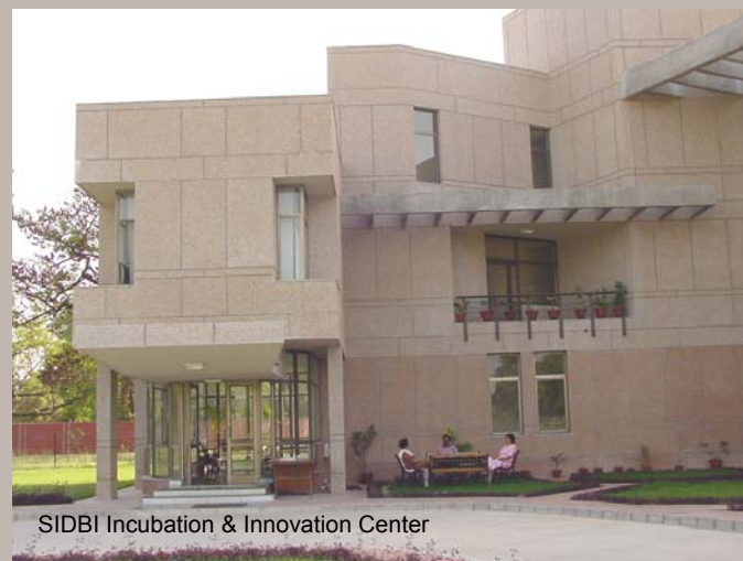
SIDBI Incubation & Innovation Center